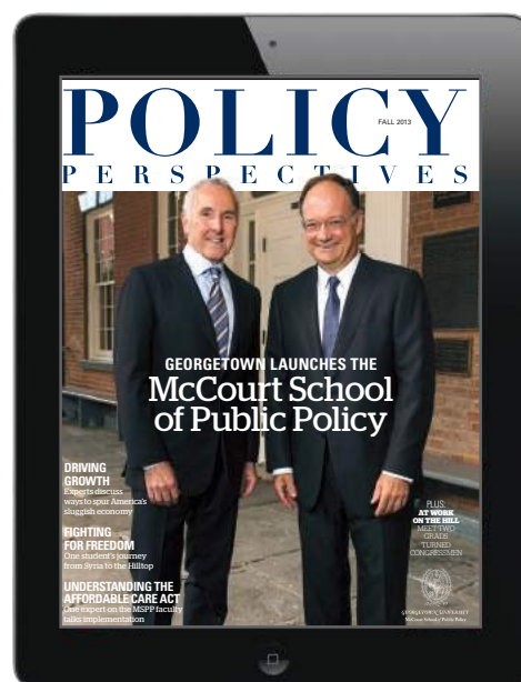
POLICY PERSPECTIVES The fall 2013 digital edition.

Our team has an extensive understanding of UX design and knows what it takes to merge eye-catching front-end design with functional, flexible back-end web development. They work seamlessly with our editorial team to ensure the design and content for your website reflect your messages and vision.