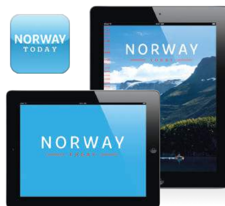
Norway Today Magazine Norwegian Embassy