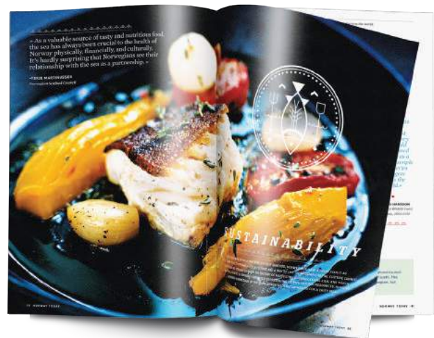
Norway Today Magazine Norwegian Embassy