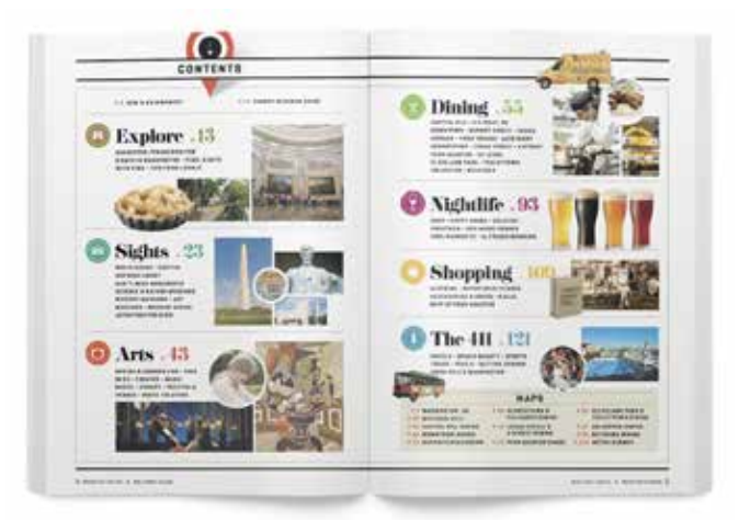
WASHINGTONIAN WELCOME GUIDE Washingtonian's biannual ancillary publication.